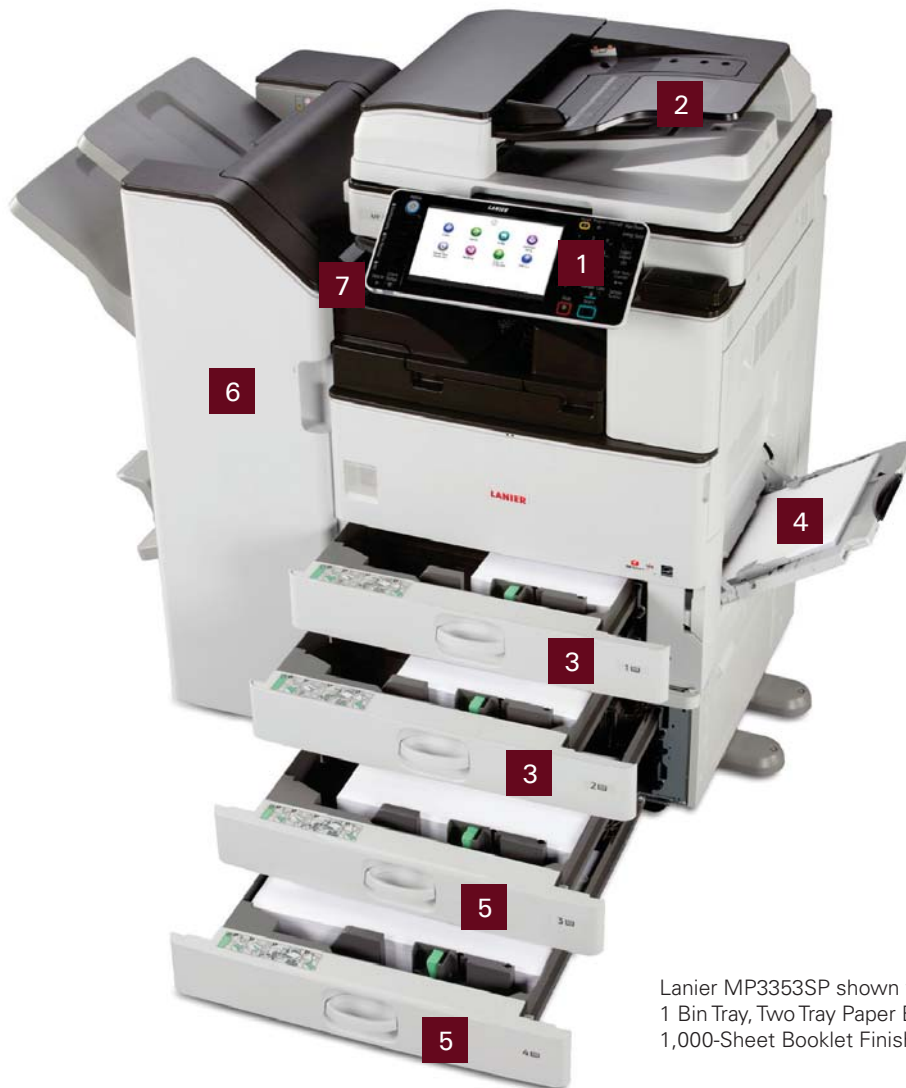
Lanier MP3353SP shown with optional 1 Bin Tray, Two Tray Paper Bank and 1,000-Sheet Booklet Finisher.