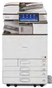
SR3180 Internal Finisher