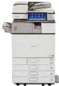
SR3130 Internal Finisher